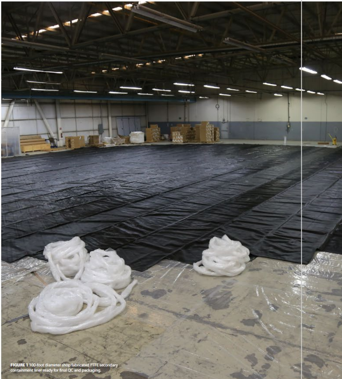
FIGURE 1 100-foot diameter shop fabricated PTFE secondary containment liner ready for final QC and packaging.