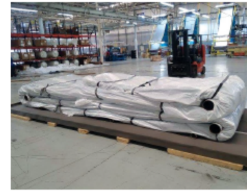
FIGURE 2 Shop fabricated PTFE liner accordion folded and ready for shipment and rapid deployment at site.

One plus one does not equal two when combining an inert material with a chemically susceptible material.