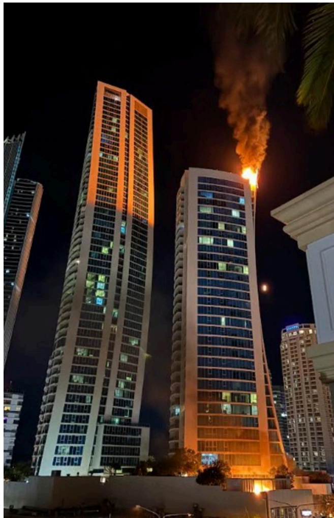
Emergency services called to fire at the Hilton in Surfers Paradise.