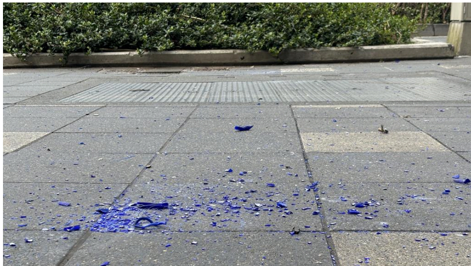
Pieces of blue glass were still on the ground after the Hilton sign fell off the building.

They had returned to the Gold Coast in the hope of using their theme park passes, though she said they were too tired to go on Friday.