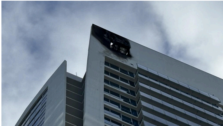
The aftermath of a fire which tore through the top level of the Hilton Hotel in Surfers Paradise.

The family of three made their way down 14 flights of stairs. Once they got to the bottom they finally heard the evacuation alarms blaring through Surfers Paradise.