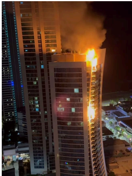
Joevy Lyn captured the moment a ball of fire dropped from the top level at the Hilton in Surfers Paradise.

A Fire Department spokeswoman said several crews were called after a fire ignited on the roof of the western tower.