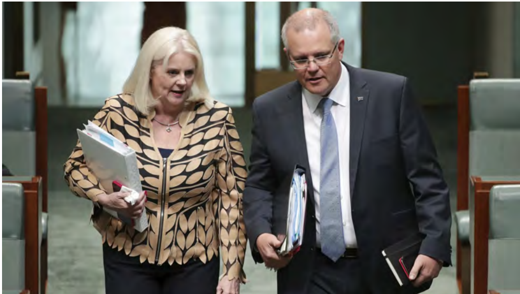
Industry Minister Karen Andrews with Prime Minister Scott Morrison.

The new taskforce will be responsible for restoring confidence in the sector.