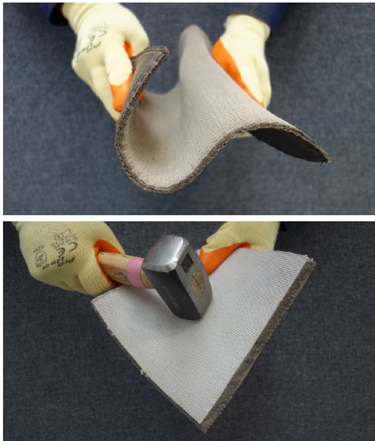
Figure 1. The change of GCCM properties from flexible to rigid on curing means that when assessing GCCM properties, appropriate test methods should be used to determine the cured, in-service GCCM cementitious layer performance.

GCCMs are the only geosynthetic to contain unset cementitious material and pre-existing geosynthetic test standards do not include methods for understanding the performance of the cementitious material contained within a GCCM. It is therefore important to test the properties of the cured cementitious material so that the behaviour of the GCCM as a hardened composite can be understood. It is also critical to ensure the cementitious material is cured at a water/powder ratio that is representative of field (in-service) hydration and not artificially controlled in the laboratory.