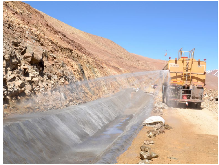
Figure 2. GCCM hydrated by spraying resulting in pooling water in the invert. These parts of the GCCM structure cure in immersed conditions.

GCCMs are hydrated in the field by spraying or immersion and whilst the hydration water is often applied by spraying, immersion almost always occurs in the field due to pooling of water on the surface of the GCCM. When testing for GCCM compressive strength it is essential that the water/cement ratio used in the cube testing is representative of the ratio achieved during hydration of the GCCM on site, in the worst-case situation.