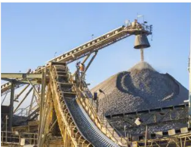
Resolute upgrades Ravenswood as it looks to expand

About 30 protesters gathered outside the company on Ingham Rd about 5am.