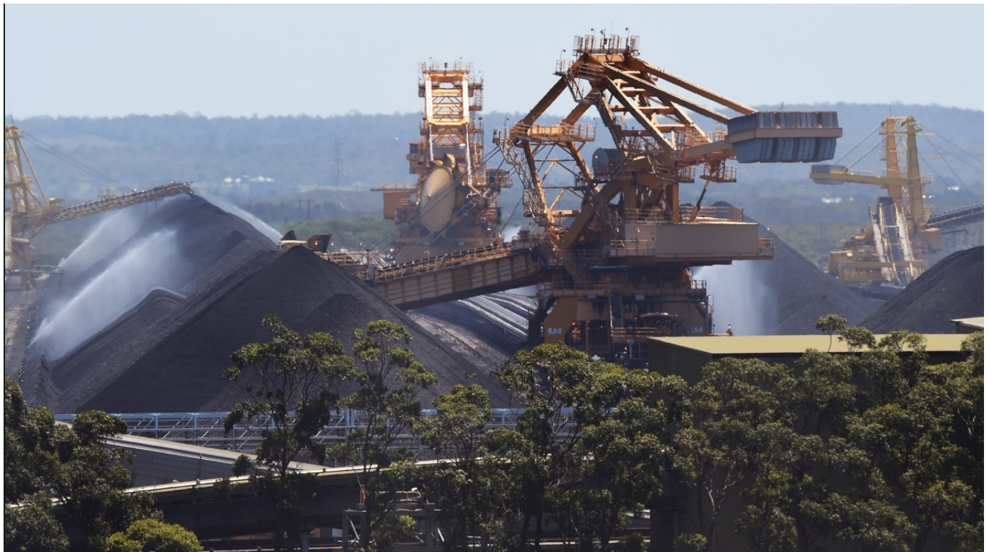
A global engineering company will quit working with mining giant Adani after being targeted by environmental activists. ...