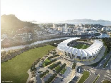
Why new NQ Stadium turf will be as good as the MCG