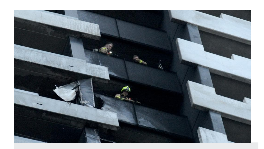
e crews at an apartment tower fire in Spencer St in February.

Real estate agents said it was a new way to spruik a property's safety features, given heightened fears over fire risk.