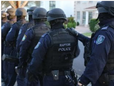
Cops target Assyrian gangs with raids across Sydney