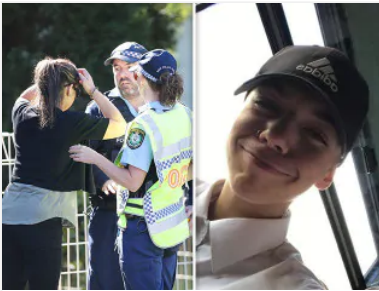
'I love you forever': Family mourns teen killed by bus

The statement details locations where water is bypassing perimeter drainage or are blocked due to building debris, as well as water and efflorescence — crystalline deposits of salts — leeching out over car spaces, and water pooling on a balcony with it penetrating up to the balcony door.