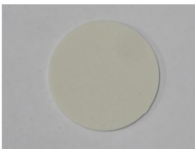
Figure 1 Photo of product