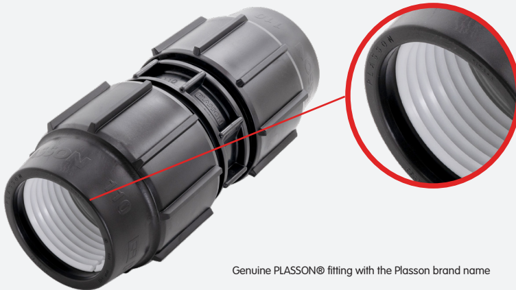
Genuine PLASSON® fitting with the Plasson brand name

Genuine Plasson® fittings have been tried and tested in various environments throughout Australia since 1978 and are the basis for reliable performance in the most demanding and rigorous applications, particularly mining.