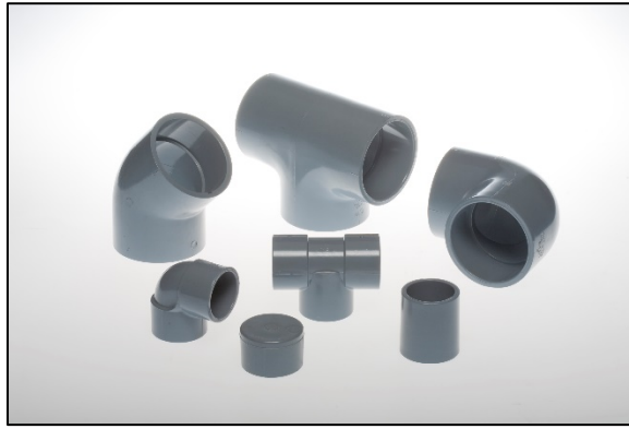
Figure 2: CPVC molded fittings

This Technical Note will explain material properties and capabilities that should be considered when designing CPVC systems for commercial building applications. The content in this document may be used to apply to applications such as hot- and cold-water distribution (potable water plumbing), fire protection, chilled water, and hydronic heating and cooling systems.