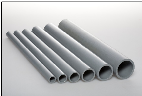
Figure 1: CPVC pipe

CPVC tubing and pipe are sold in straight lengths for use with molded fittings. See Figures 1 and 2 .