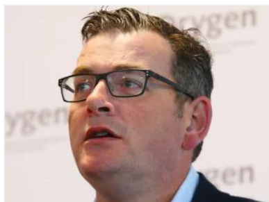
Union calls for pay limit for Victorian MPs

Bureaucratic bungling is behind the lengthy delay in finalising disciplinary proceedings against the two men who signed off on the Lacrosse building’s flammable cladding .