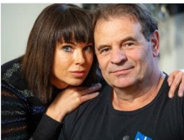
Labor silent on new Setka allegations

However, most members who sat on the board have resigned, or their terms have expired and they have not been replaced.