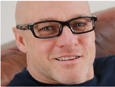
Why Aussie men don't want to be dads

“Cases before the Building Practitioners Board can only be finalised when all parties are available for the hearings to proceed and there is a variety of reasons why delays have occurred in relation to the outstanding matters,” he said.