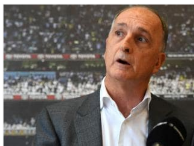
Former cricketer lands plum fish market role

Law firm questions NSW Government cladding taskforce