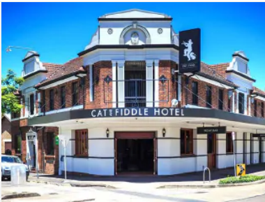
Balmain's newest old pub

In November, The Times revealed several buildings across The Hills had been identified to potentially contain combustible cladding.