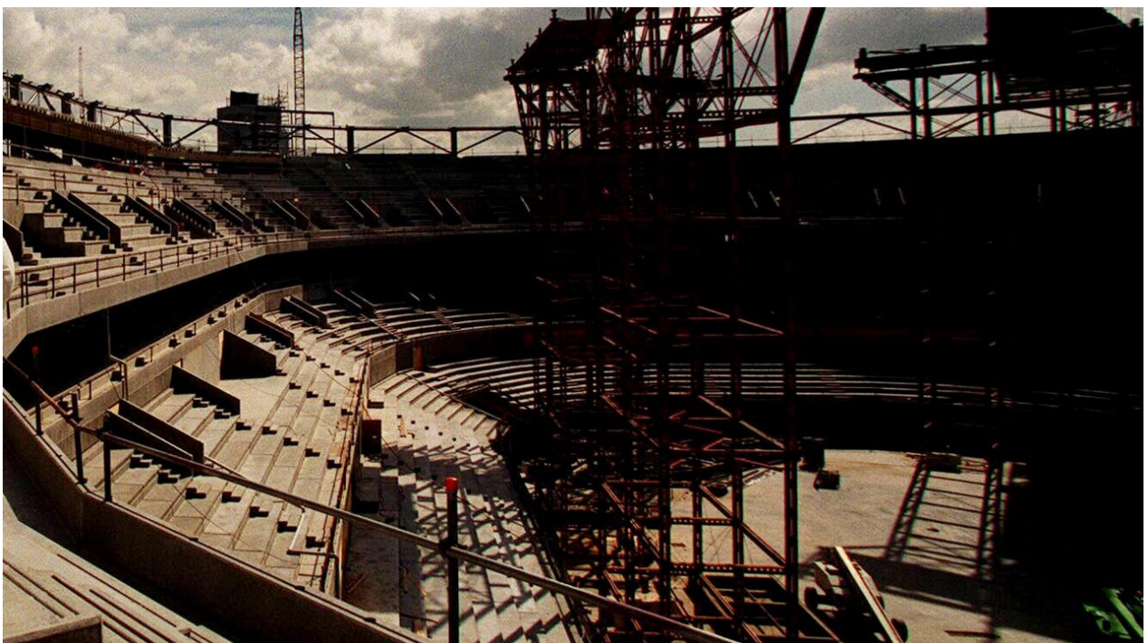
A photo of the site during its construction in 1999.

Aluminium composite cladding panels previously met the state’s building regulations – including at the time of Qudos Bank Arena’s construction in 1999.