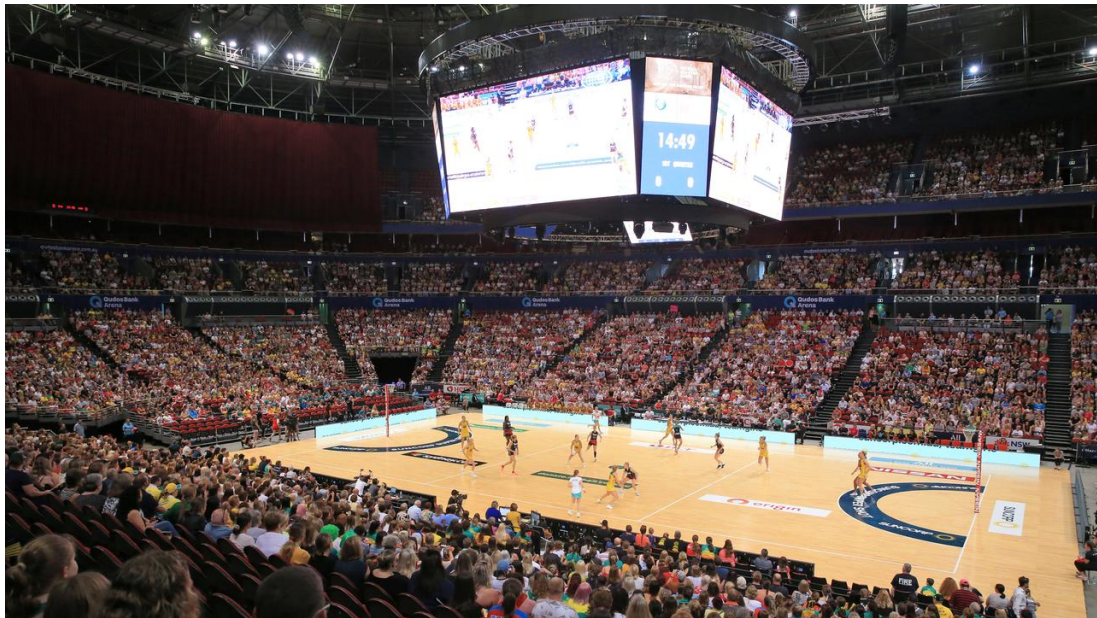
The arena is one of Sydney's leading sporting and entertainment hubs.

In more recent times the arena has been refashioned into a mass vaccination hub, partly used to vaccinate the 24,000 Year 12 HSC students from the eight coronavirus-hit council areas of Sydney.