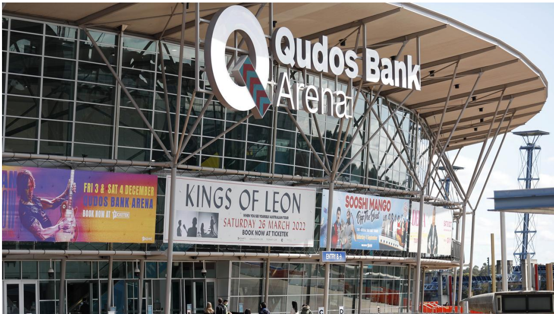
The order follows a site inspection last month.

The Department of Planning said about 30 per cent of the panels on the exterior of the building will be required to be replaced under the order with a deadline of February 2023.