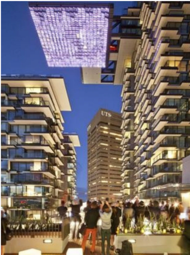
The development includes vertical gardens and light structures.

The department has not publicly confirmed how many composite cladding panels it claims are contained within the site.