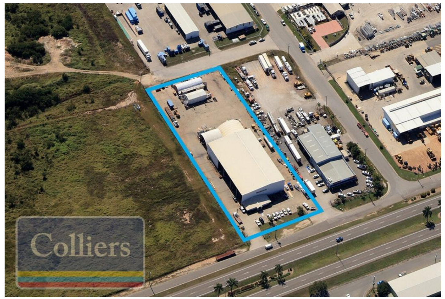
Clover Pipelines has moved into a warehouse at 487 Woolcock Street, Garbutt, and will open in January 2024.

The site at 487 Woolcock Street appealed to Clover due to its size, accessibility, and modern facilities.