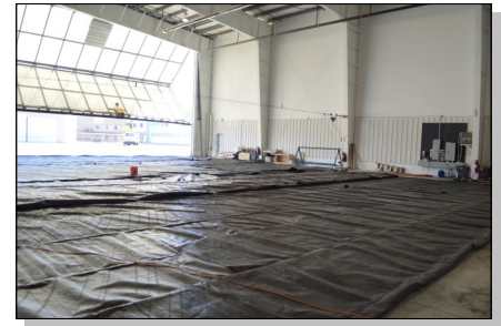
Fabrication of a large scale TCI CrossFilm™ secondary containment liner.