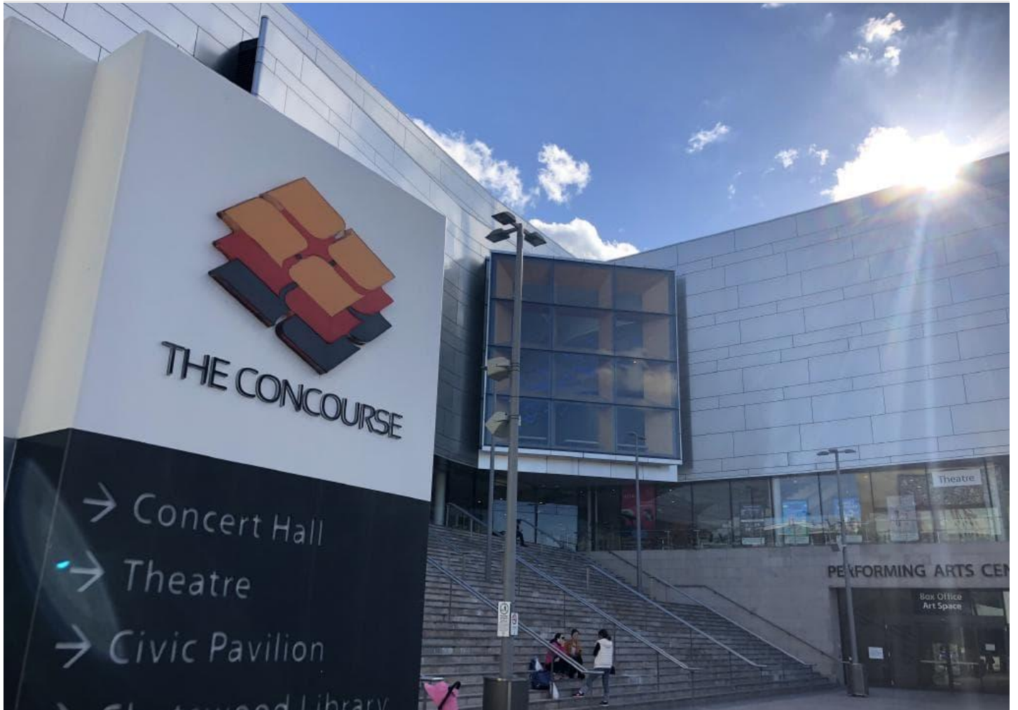
The Concourse at Chatswood is cladded is similar to that which contributed to a London tower fire last year in which 72 people died.