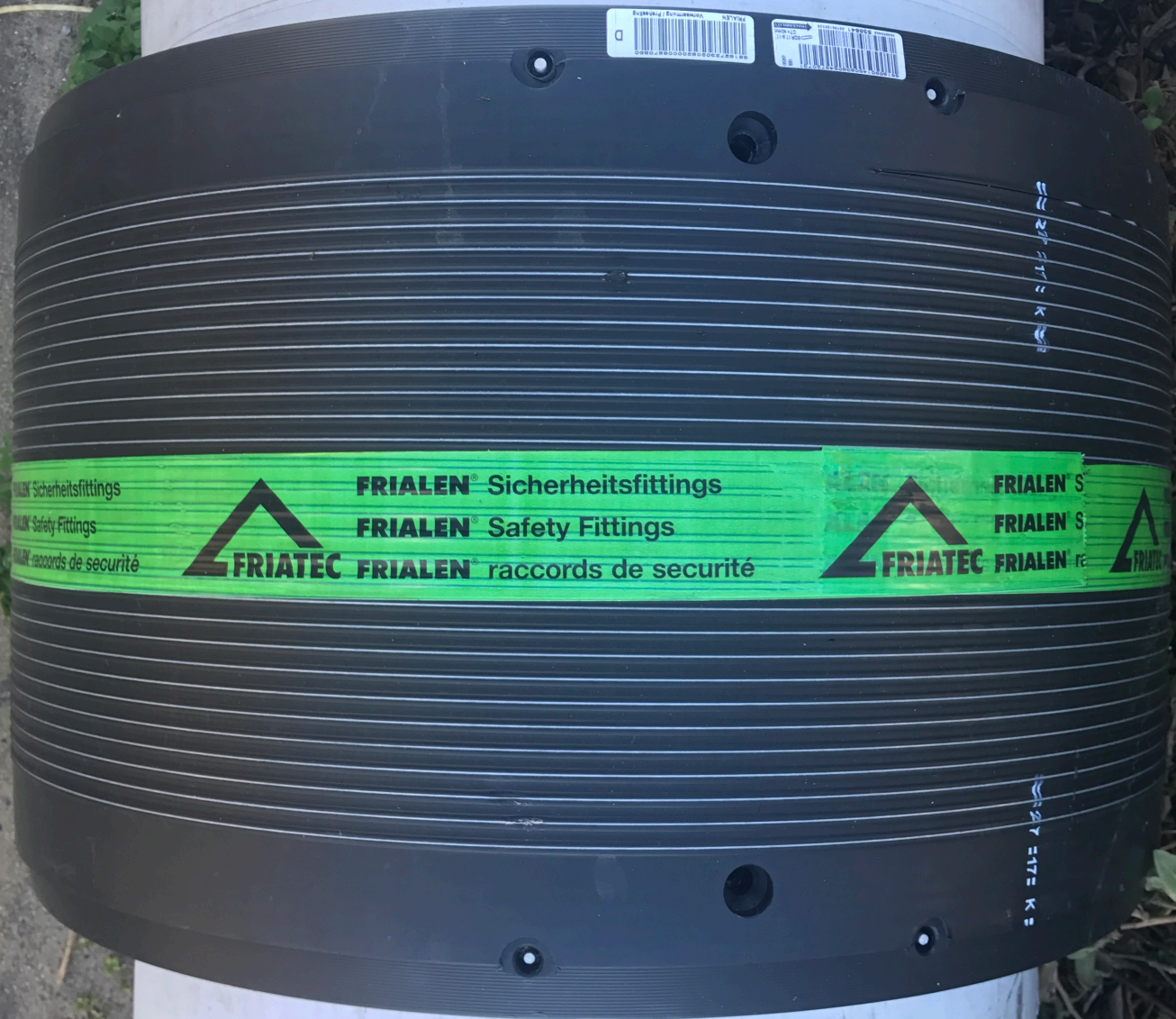
Melbourne Water Sewer Bypass Brighton