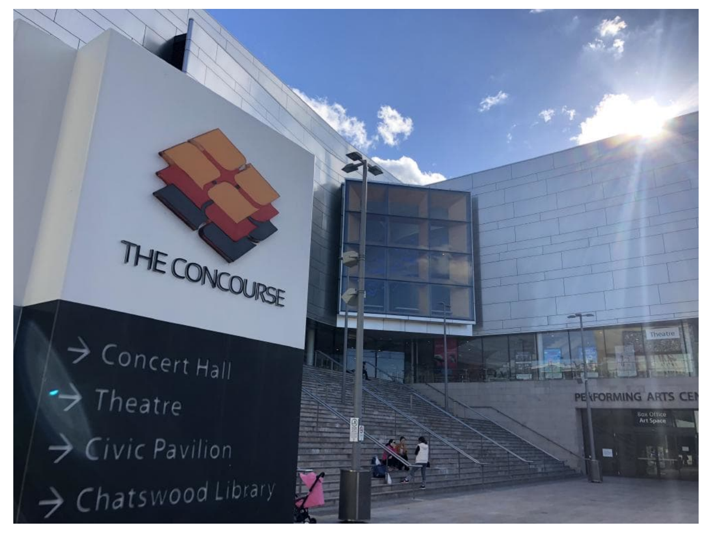
Figure 1 The Concourse at Chatswood is cladded is similar to that which contributed to a London tower fire last year in which 72 people died.