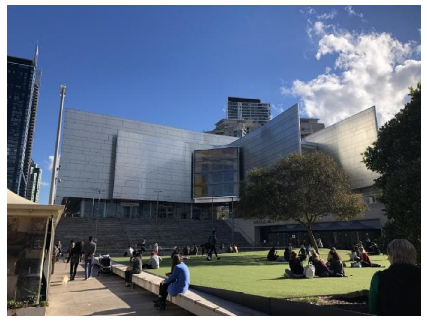
Figure 4 The Concourse is a popular place to relax in Chatswood

"It's premature to throw numbers about."