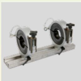
Restraining and alignment equipment