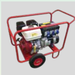
Generator of suitable size to power control box - refer to manufacturers' literature for power requirements