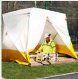
Welding tent/shelter and ground sheet