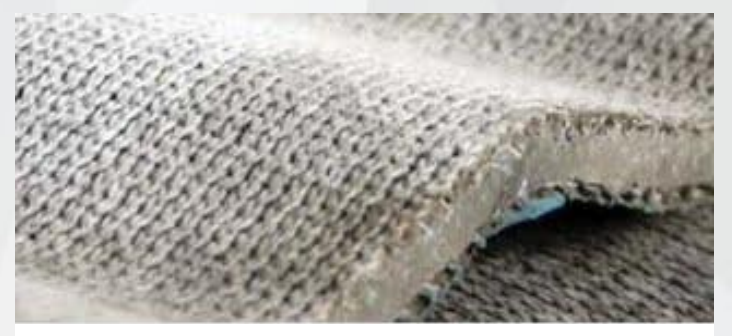
Fibrous top surface (surface to hydrate)