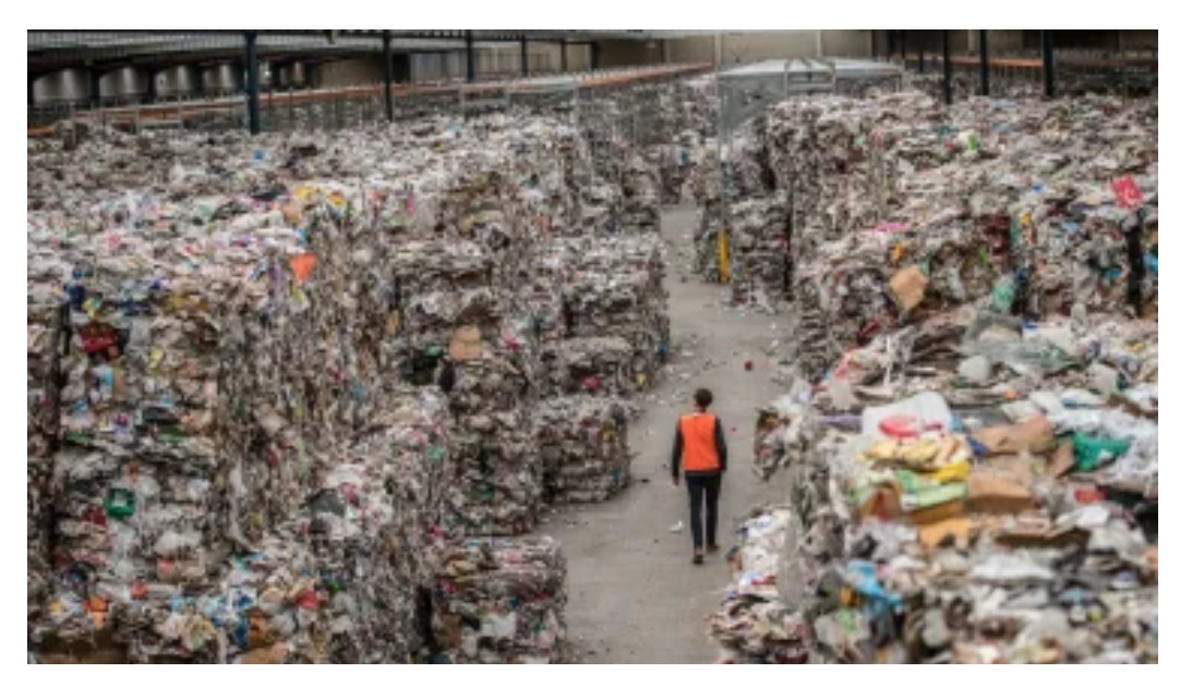
Australia exported around 4.5 million tonnes of waste in financial year 2018-19.

A Melbourne company has been funded with $2.9 million to develop a commercial use for the massive haul of flammable building cladding, which is being stripped from hundreds of Victorian buildings.