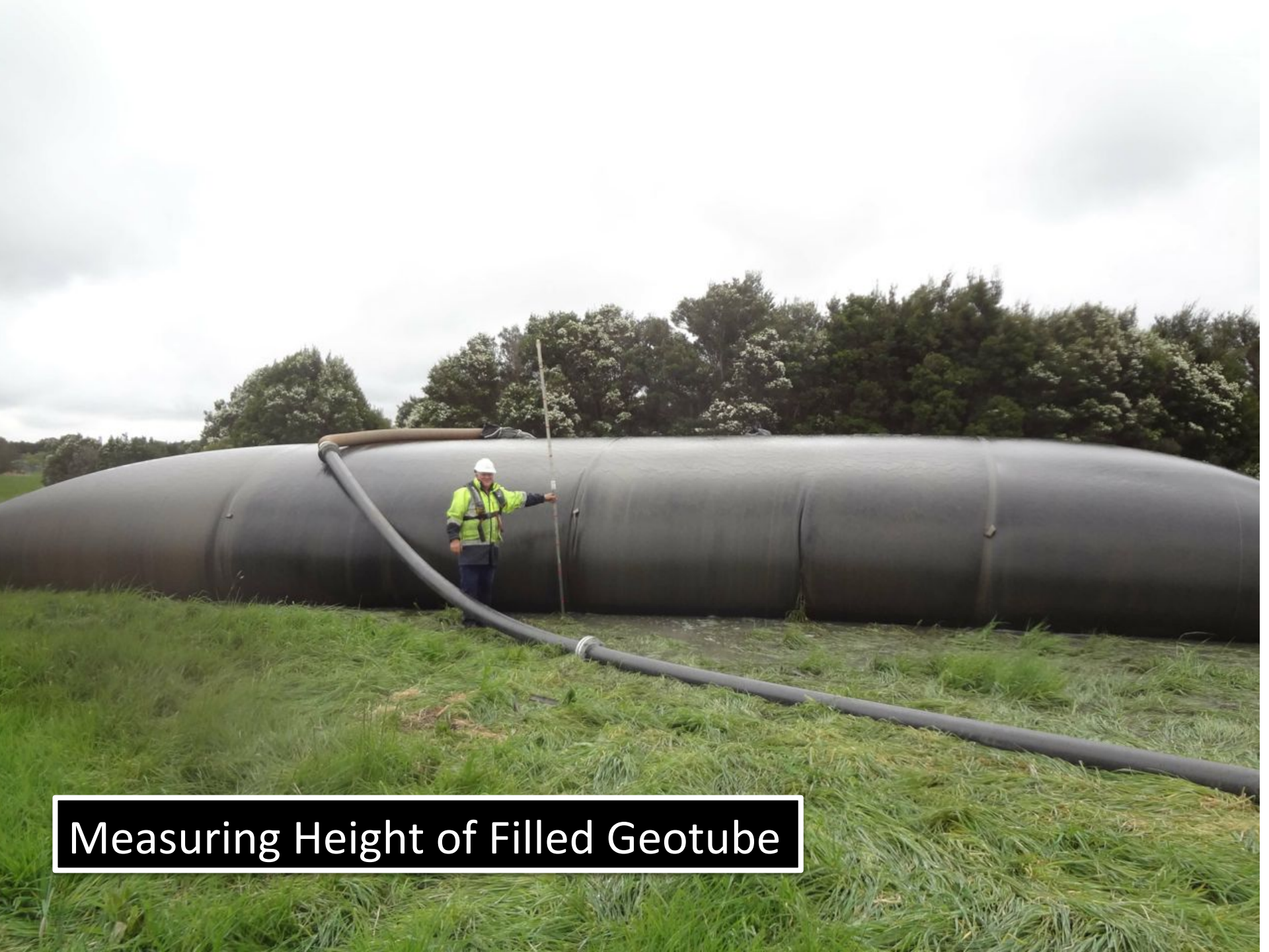
Measuring Height of Filled Geotube