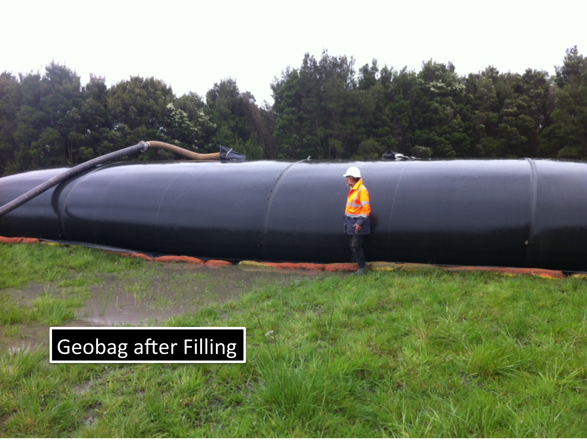
Geobag after Filling