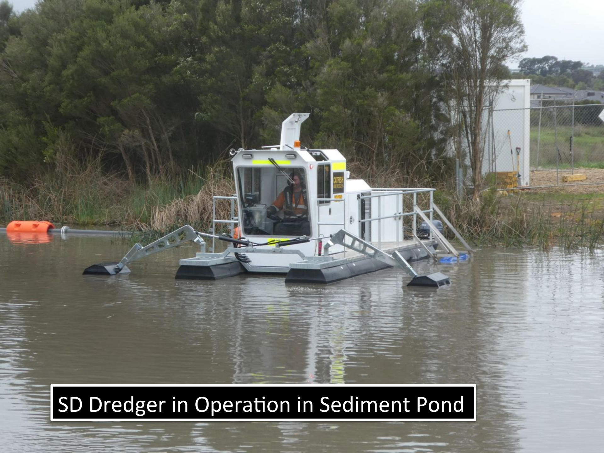
SD Dredger in Operation in Sediment Pond