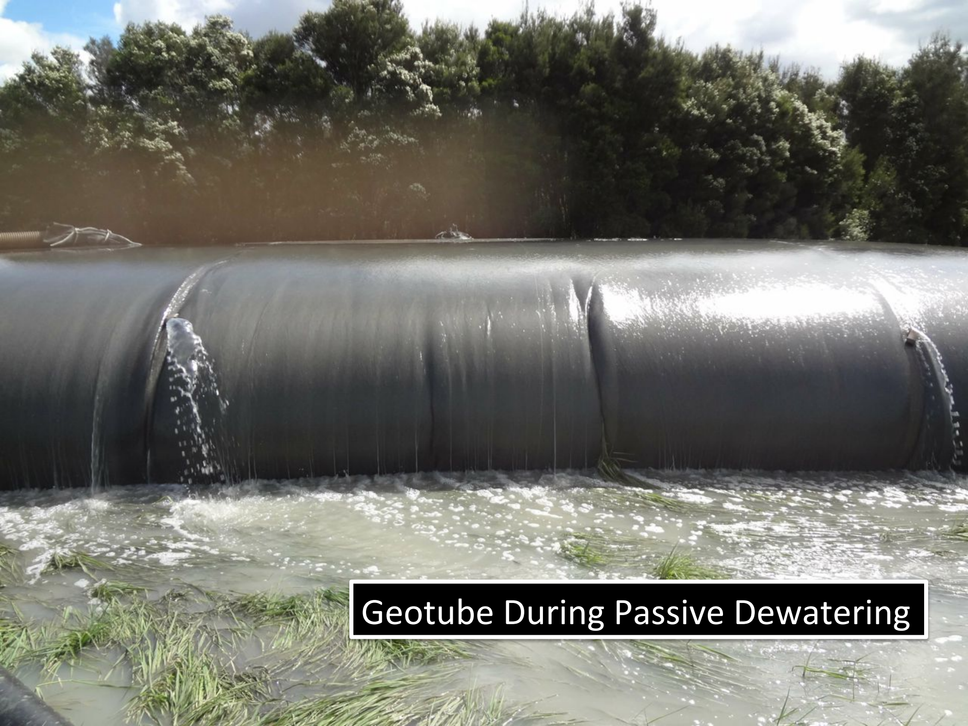
Geotube During Passive Dewatering