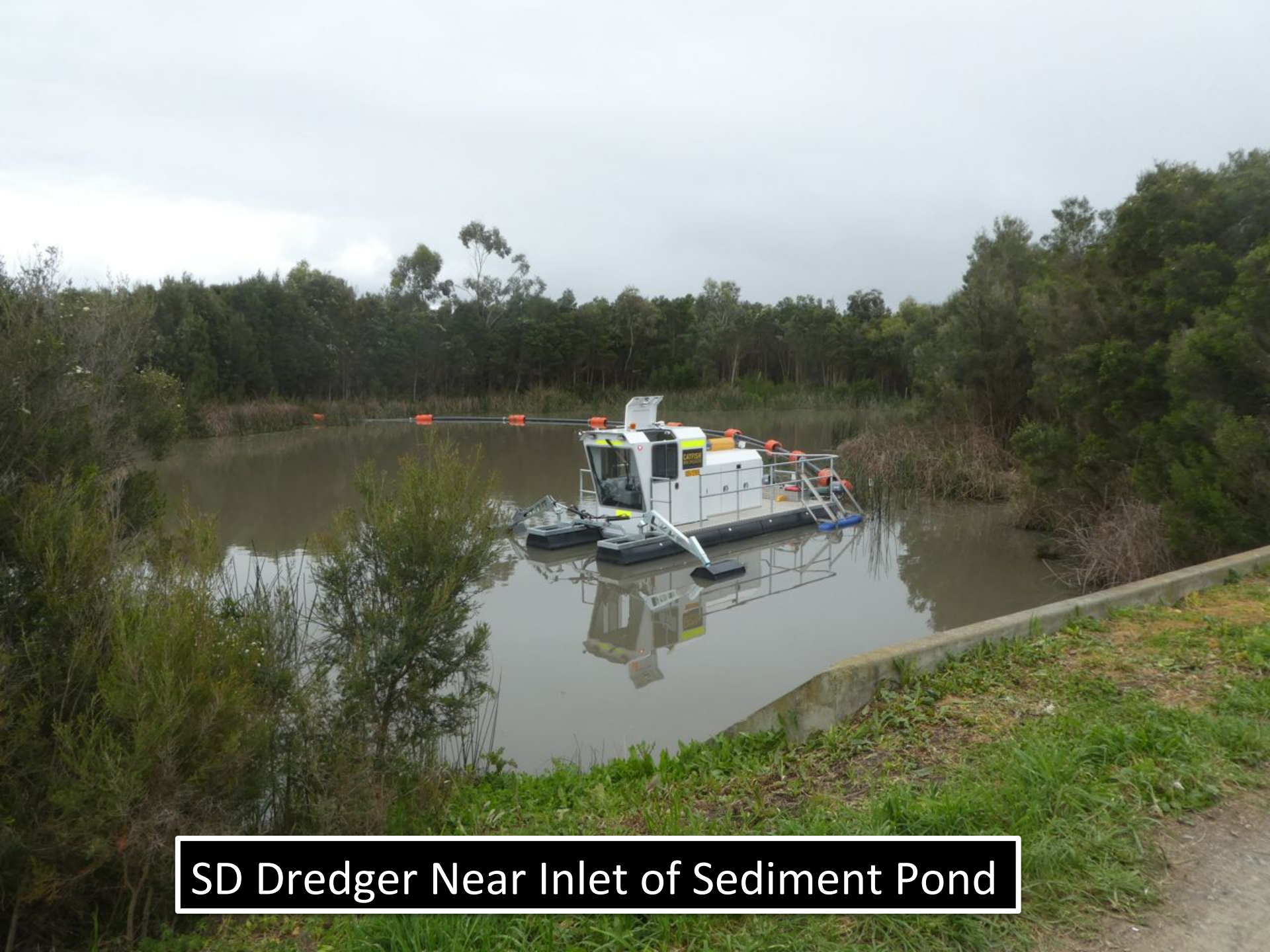
SD Dredger Near Inlet of Sediment Pond