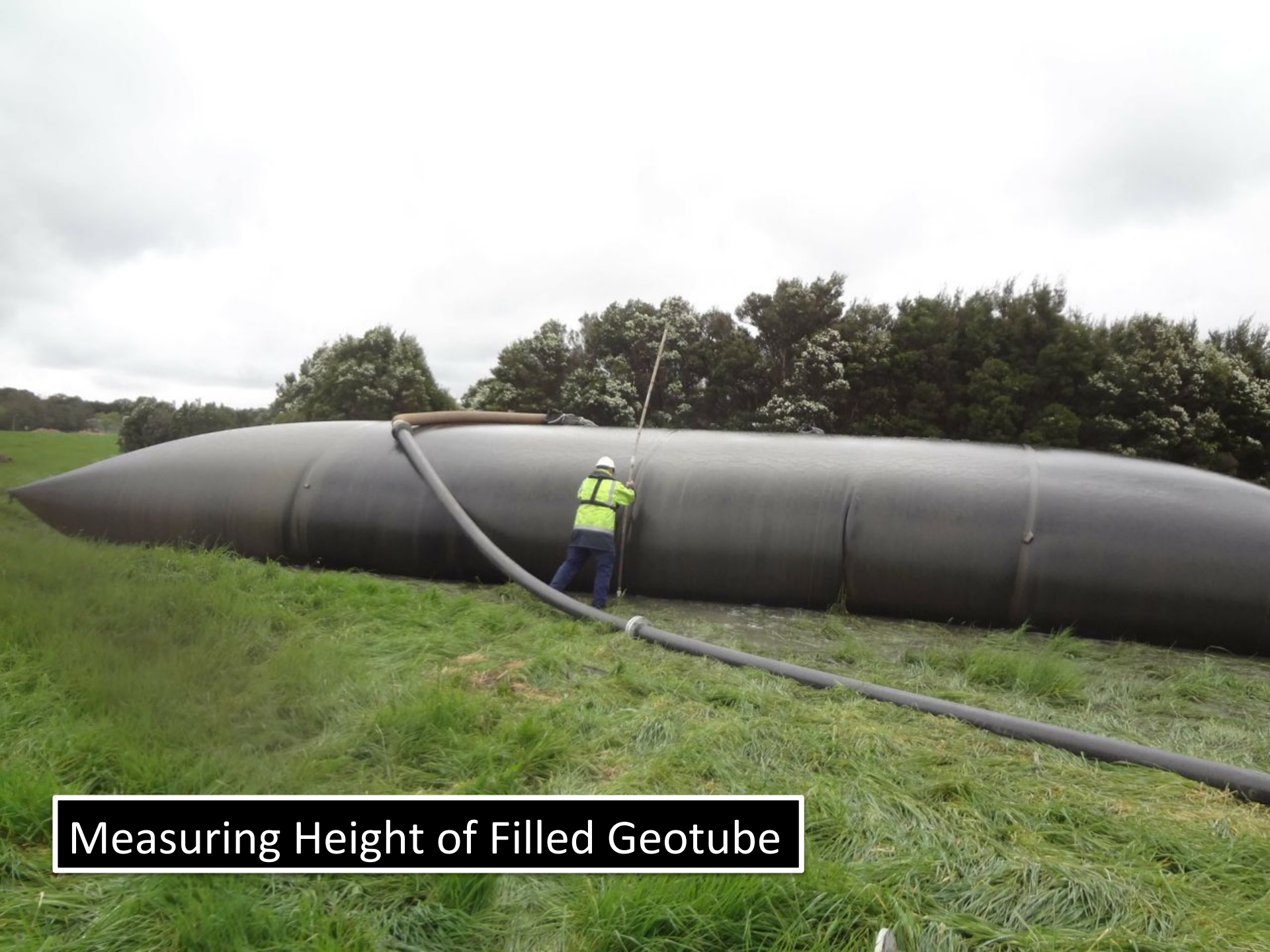
Measuring Height of Filled Geotube