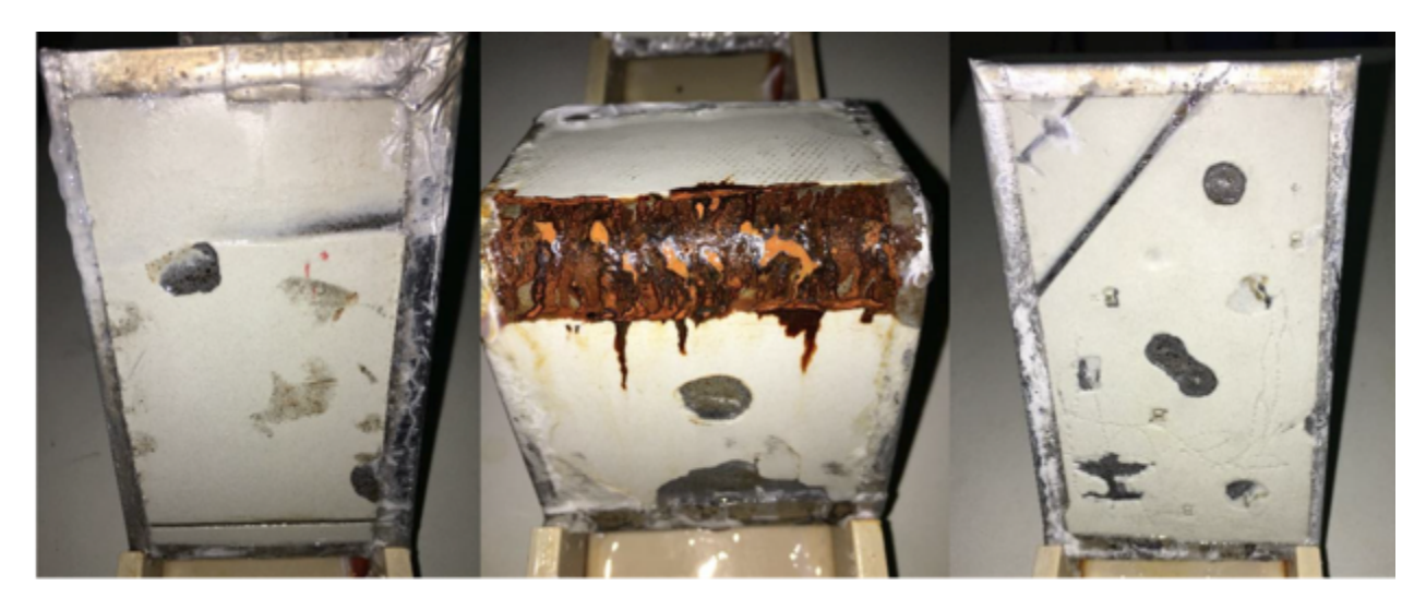
Figure 2 – EonCoat panels with intentional damage after 335 hours of B117 exposure.

Then the panels were subjected to ASTM B117 conditions; the figures show the duration time for the panels. In the pictures below, we show the panels before B117 testing and then after 335 hours (Figure 2) and after 1,870 hours (Figure 3). In all cases, there is not rust in the areas where the panels were intentionally damaged, aside from the 90^{\circ} bend in the panel. Again, the panels show no sign of rust. Organic coating would have failed to control the corrosion in these conditions.