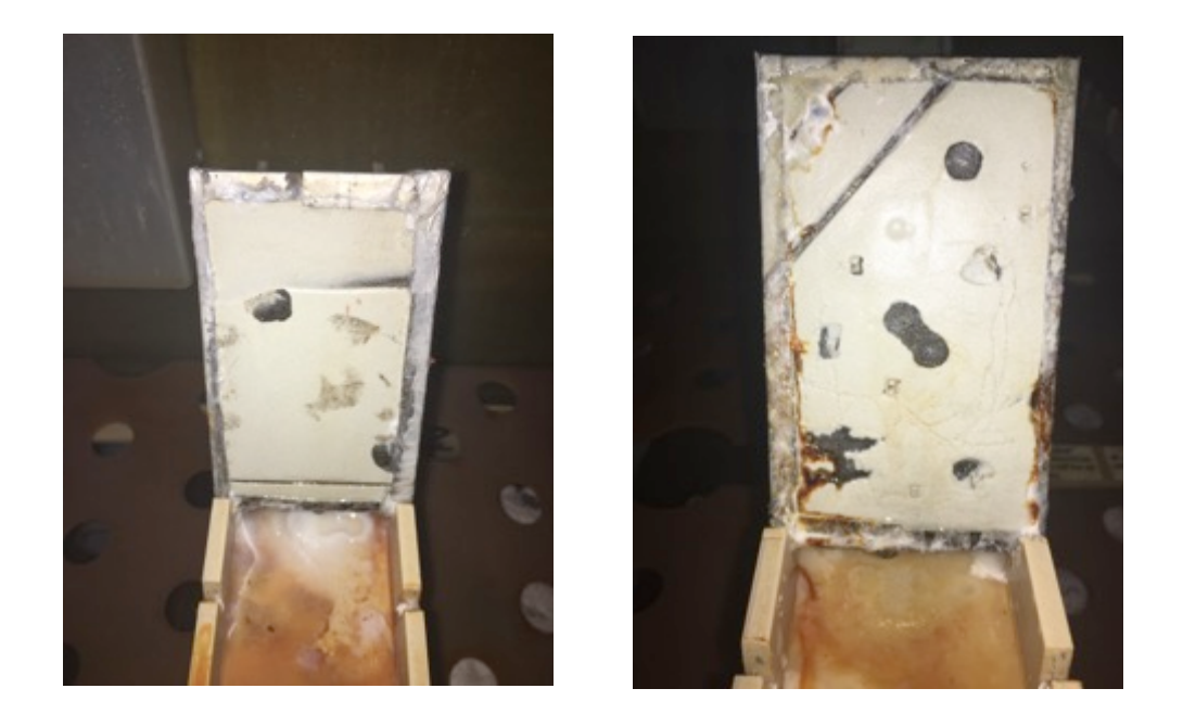
Figure 3 – EonCoat panels with intentional damage after 1,870 hours of B117 exposure.

Where new steel is exposed, that section of the panel rusted, as expected. But notice on the portion of the panel that was bent – at the edge of the EonCoat, there is no rust along the entire line. Meaning, when the EonCoat forms a chemical bond with the surface of the steel, the protective layer is formed. When this occurs the mechanical integrity is maintained. (It should be noted that in the field, if a section of tank or pipe incurred mechanical damage as severe as a 90^{\circ} bend, that steel would be taken out of service as it would be permanently deformed.)